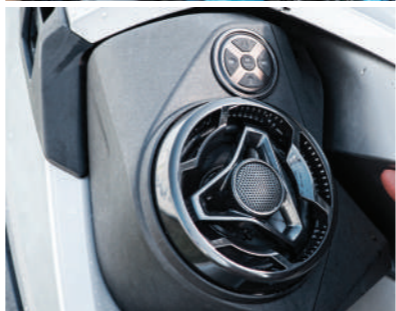
BRP AUDIO PREMIUM