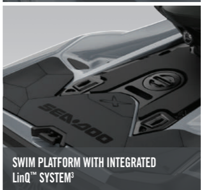
SWIM PLATFORM WITH INTEGRATED LinQ™ SYSTEM 3