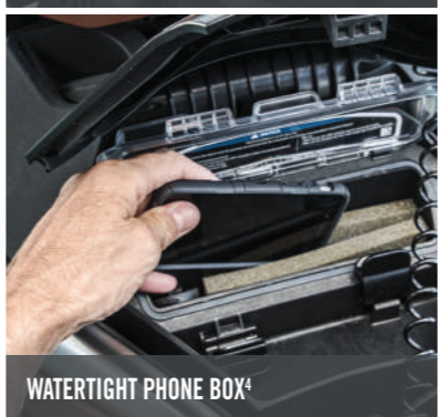
WATERTIGHT PHONE BOX 4