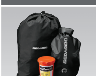
EXCLUSIVE LIMITED PACKAGE