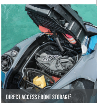
DIRECT ACCESS FRONT STORAGE 2