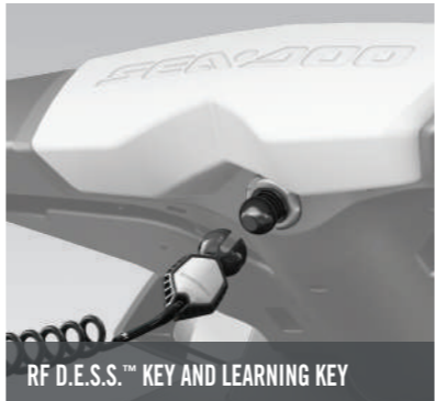
RF D.E.S.S.™ KEY AND LEARNING KEY