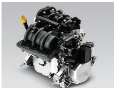
ROTAX® 900 HO ACE™ ENGINE