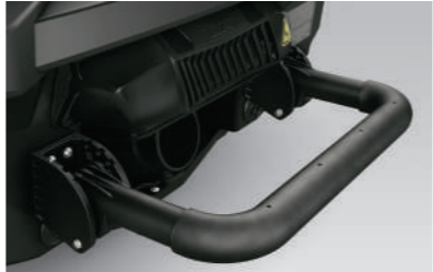
REBOARDING LADDER (ACCESSORY)