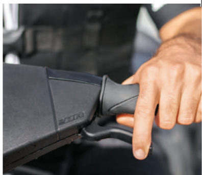
iBR® (INTELLIGENT BRAKE & REVERSE)