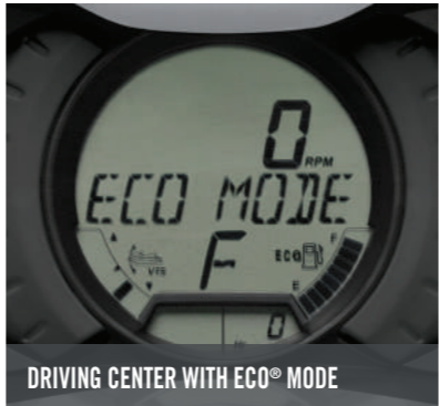
DRIVING CENTER WITH ECO® MODE